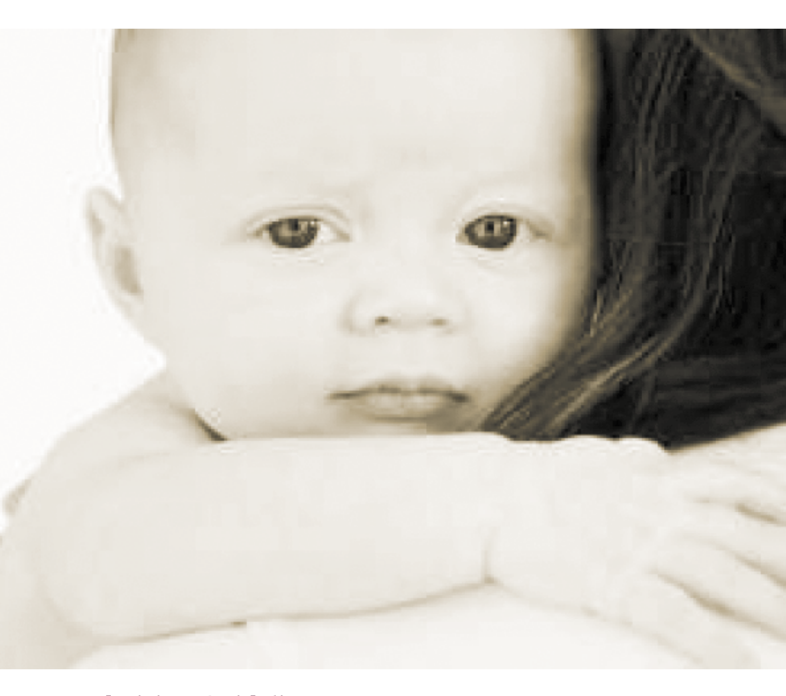
Fundraising Guidelines Essential Information for Community Fundraisers